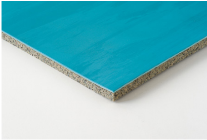
MONDOFLEX II - Texture