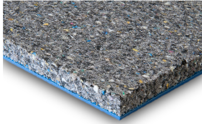
MONDOSPORT II - Backing