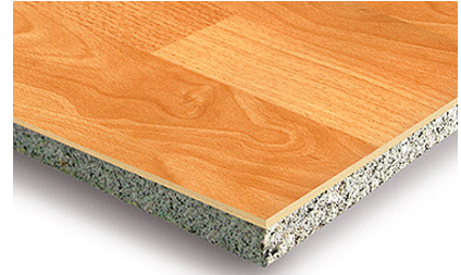
MONDOSPORT II WOOD

Vinyl Point Elastic multi-purpose sports flooring.